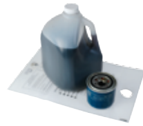
Auto products: motor oil & filters, old fuel, batteries