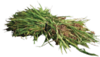
Large plant debris (up to 7' x 4' x 2' and/or 100 lbs, must be bundled and tied)