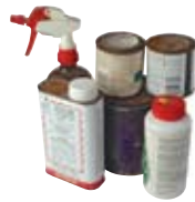
Pesticides, herbicides & fertilizers