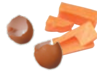
All dairy products, eggshells