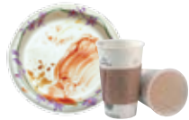
Paper plates, cups, napkins, towels & tissues