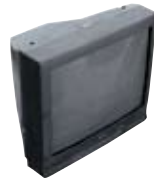
E-Waste (computers, monitors, TVs & other items containing cathode ray tubes, LCD or plasma screens)