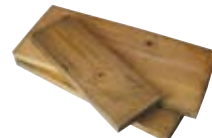
Untreated & uncoated wood scraps & chips