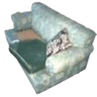
Furniture & carpets