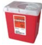
Medical Waste (needles, syringes, etc.)