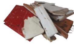
Treated wood (painted or stained)