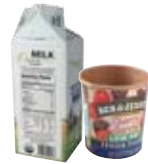
Waxed paper cartons (milk, ice cream, juice)