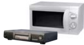
Stereos, DVD players, microwave ovens & other small devices