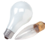
Non-fluorescent light bulbs

AND: Cat litter & pet feces, leather & rawhide, vacuum bags, plastics other than #1-7 (please cut 6-pack rings)