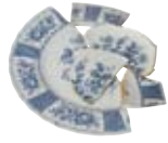
Ceramic plates & cups