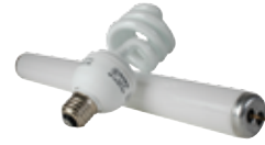
Fluorescent light bulbs