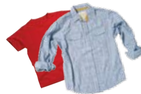
AND: Clothing is also accepted, but please consider donating used clothing to charity