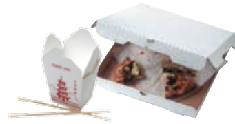
Pizza boxes & take-out containers