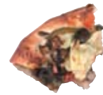
Leftovers & plate scrapings