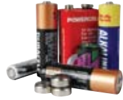
Household batteries (please see page 7 about recycling batteries)