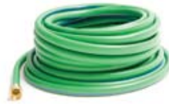
Hoses (rubber or garden)