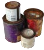
Paint, stain, varnish, thinner & adhesives